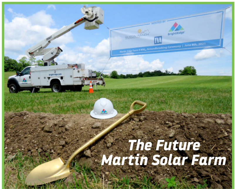
The Future Martin Solar Farm